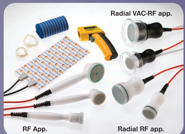
Radial VAC-RF app.

Different sizes for noninvasive, painless, safe and very effective therapy.