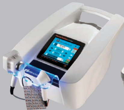
PHYSIO STATION PRESTIGE (Code: 1800412)