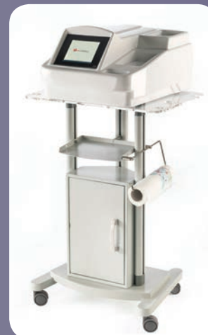
Trolley Green eco