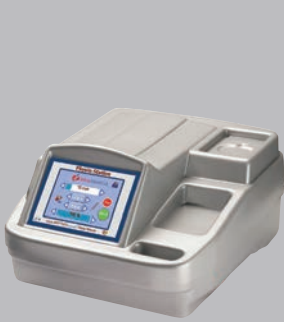
PHYSIO STATION (Code: 1800410)