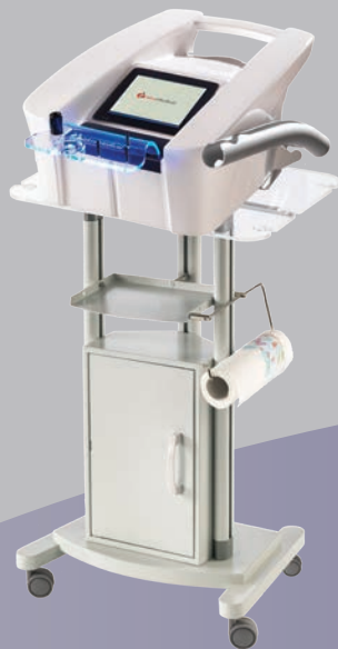
Trolley Prestige eco (Code: 4900283)

Simple, inexpensive, and space-saving solution. Fits in every office.