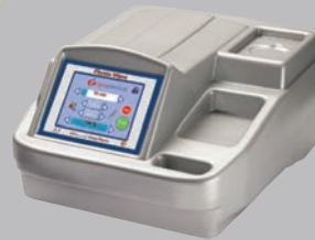
PHYSIO WAVE (Code: 1800407)