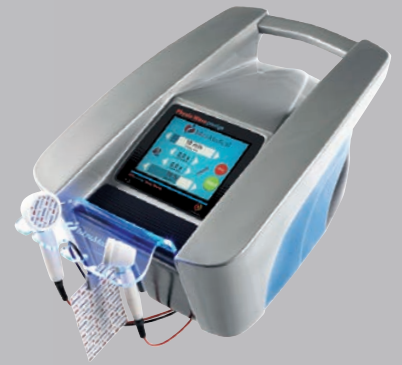
PHYSIO WAVE PRESTIGE (Code: 1800406)